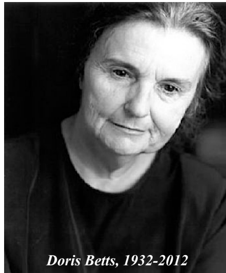
Doris Betts, 1932-2012

Betts' book collection reflects her varied interests, ranging from books